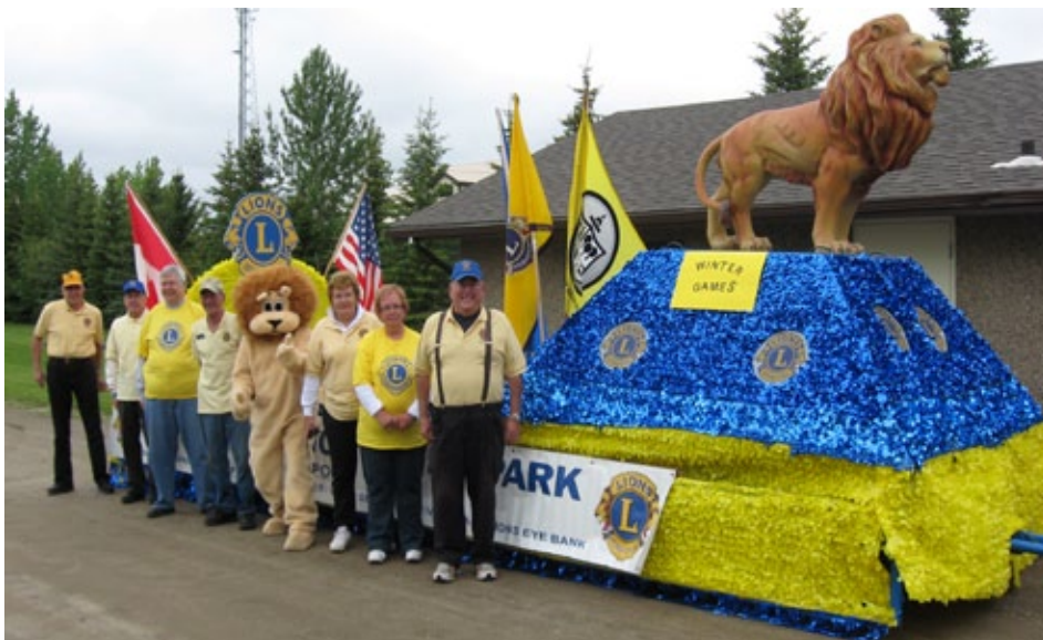
The Lions Float , as seen in the Farmers' Day Parade in Stony Plain, June 4 The humans are members of Stony Plain Lions. The Lion???

Jasper Lions have sponsored a bicycle auction since 1970, offering abandoned, lost, and donated bikes (refurbished by the Club). This year the auction raised $5395 with the sale of 60 bikes, on May 14.